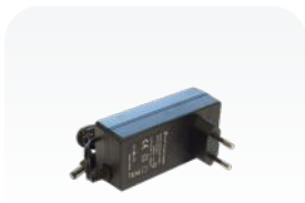
24V 1.5A power adapter