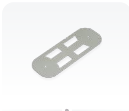
Ceiling mount base