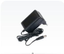
24 V 0.8 A power adapter