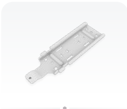
Outdoor case bracket