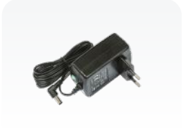
24 V 1.2 A power adapter